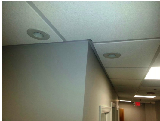
The Unico System outlets match nicely to interior