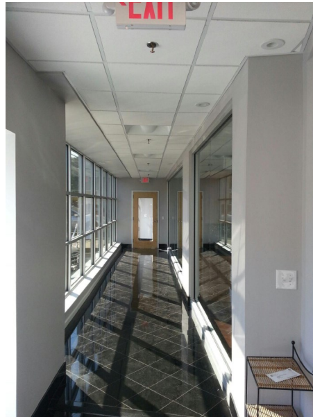
Unico outlets shown in hallway