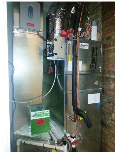
Unico System installed in vertical position