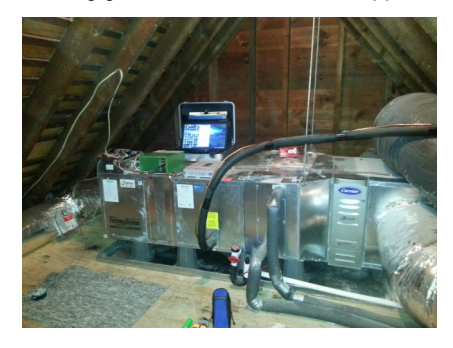
The Unico System ECM Software being configured via laptop

Scott concludes, "All of these factors make for very happy customers. They got the new system and we didn't have to alter the house. The system has been working great and we couldn't be happier either."